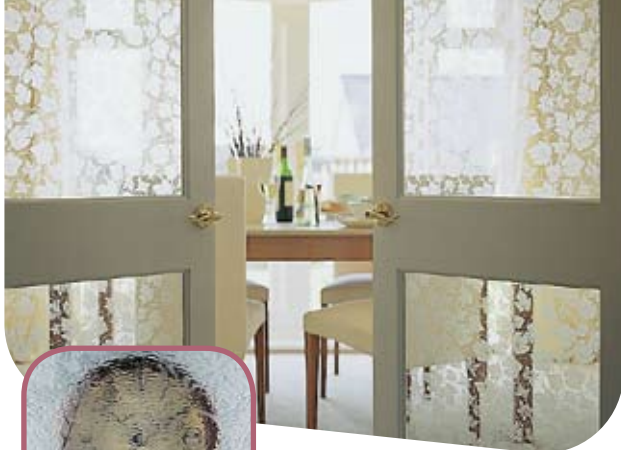
Pilkington Oriel Coppice™