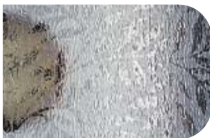
Pilkington Oriel Texture Laurel™