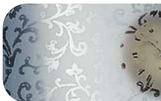
Pilkington Oriel Brocade™

With a superb range of designs, together with diffused glass options for each design, this premium range of etched glass adds a touch of style and elegance to your home.