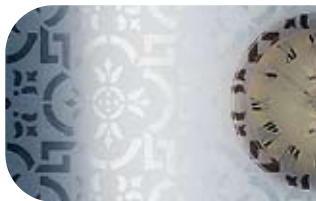
Pilkington Oriel Canterbury™