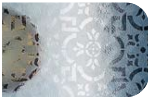
Pilkington Oriel Texture Canterbury™