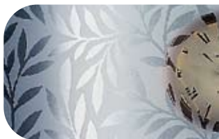
Pilkington Oriel Laurel™