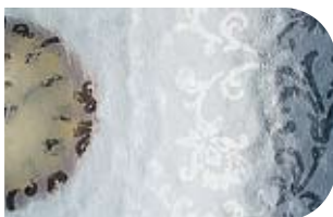
Pilkington Oriel Texture Brocade™